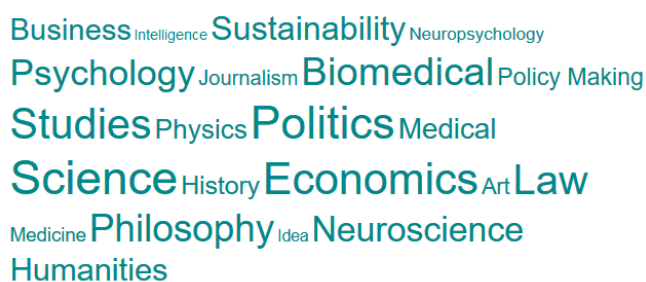
Figure 3: in what field will your masters be?

54% indicates that they will immediately commence with a master program after their current program. 26% will travel or work for a year. 4% will have to do a pre-masters and the rest does not know yet. Respondents will pursue their masters in a variety of fields (figure 3). 34% of them will do so in the Netherlands, 25% will do so in the EU/EEA, 10% will do so outside the EU/EEA and 29% does not know yet.